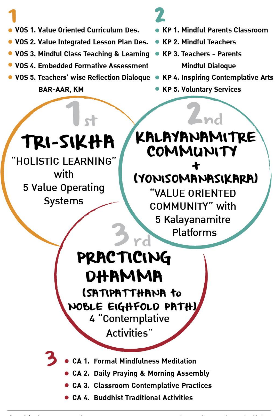
Graphic 4 : Proposed CONCEPTUAL FRAMEWORK in Implementing Mindful F-T-S Model in Thai Buddhist Schools

1st Core Value System: Holistic Learning consists of 5 Value Operating Systems, VOS1) Value oriented Curriculum System, VOS2) Value integrated Lesson Plan, VOS3) Mindful Class Teaching and Learning, VOS4) Embedded Formative Assessment, and VOS5) Teachers' s Wise Reflection Dialogue.